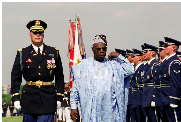
General Olusegun Obasanjo.

In 1993, the military annuls elections and transfers power to the Interim National Government. Later that year, General Sani Abacha seizes power and suppresses his opposition. When he dies in 1998, Major-General Abdulsalami Abubakar comes to power as his successor. In 1999, parliamentary and presidential elections take place and General Olusegun Obasanjo is sworn in as president.