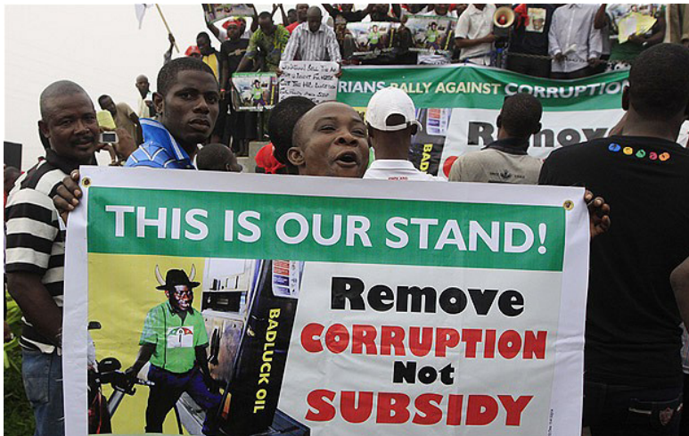
Nigerians protest rising oil prices. (Photo by AP. "People protest following the removal of fuel subsidy by the Government in Lagos, Nigeria." London: The Telegraph, 2012. Courtesy of telegraph.co.uk.)

The 2000s are marked by growing violent clashes and tensions between Christians and Muslims. Nigeria's economy thrives due to oil exports. It becomes the first African country to clear its debt with the Paris Club of lending nations. While oil is a great export, the industry is plagued by strikes and corruption. Olusegun Obasanjo holds the presidency until April 2007, when Umaru Yar'Adua of the ruling People's Democratic Party wins elections. During this period, border disputes with Cameroon increase violence until August of 2008, when Nigeria hands over the Bakassi peninsula to Cameroon, ending a long-standing dispute. The current President of Nigeria is Goodluck Jonathan. The militant Islamic group Boko Haram opposes western education, and recently kidnapped 500 girls enrolled in secondary school.